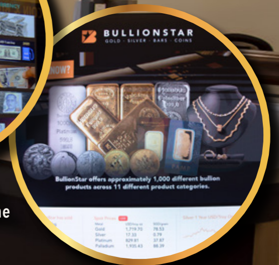
Find out more about BullionStar and precious metals on interactive screens and displays