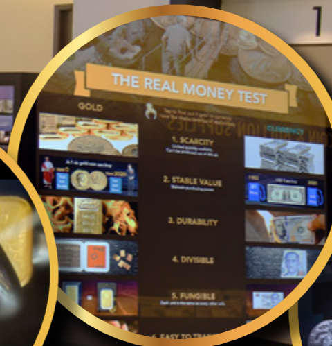
Play our interactive bullion & money game